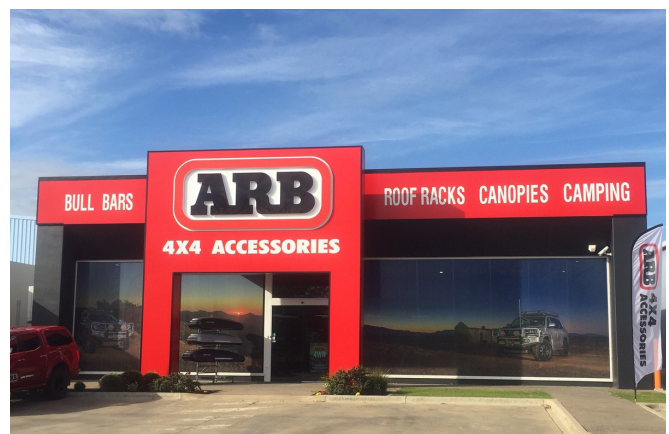
ARB WAGGA WAGGA, NSW