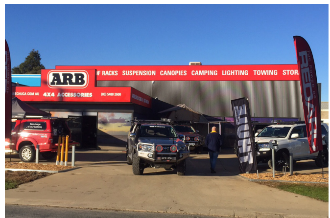
ARB ECHUCA, VIC